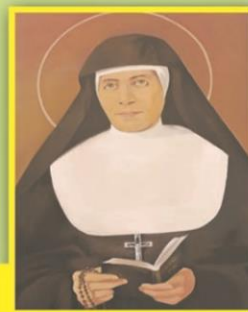
ST. MARY DOMENICA MAZZARELLO